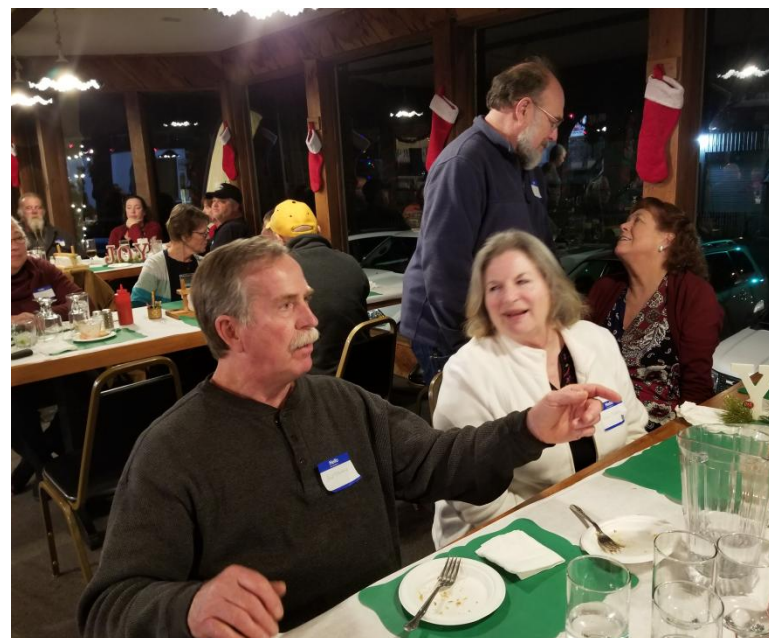
It's party time at the CAF Appreciation Dinner.