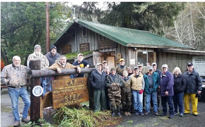
2017 Spawning crew.