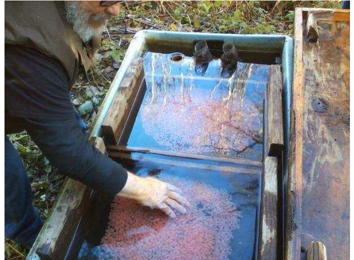
Distributing eggs in Cedar Creek hatch boxes.