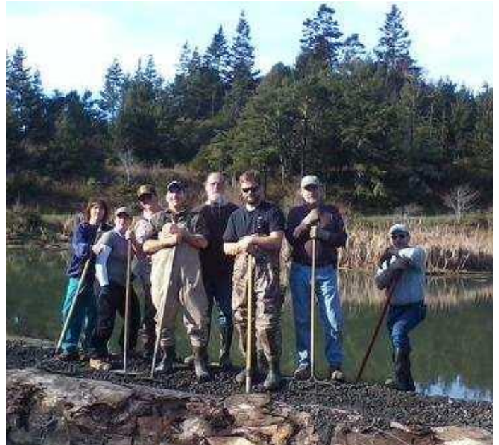
Dedicated workers at Arizona Pond