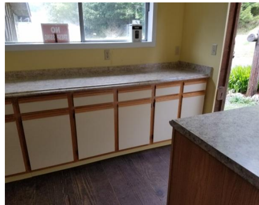
Remodeled hatchery office.