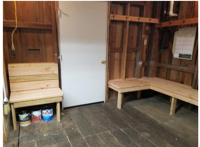
New office remodeling in progress

With the fish now in the raceways, our volunteers are back on the job with the daily feeding of fish and cleaning the raceways. Along with that, we are also still making improvements to the hatchery. For the fish, we are about half way through with the predator netting project. We have the new netting covering the raceways up but still have the sides and ends to do. We have the side netting at the hatchery ready to be put up. I'm working on getting the new ends ordered and delivered soon.