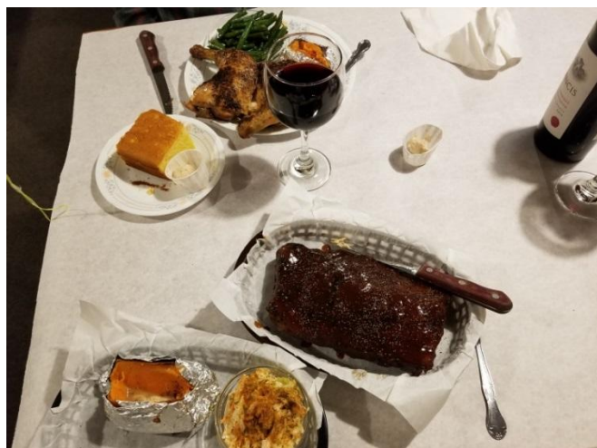
Excellent meals.