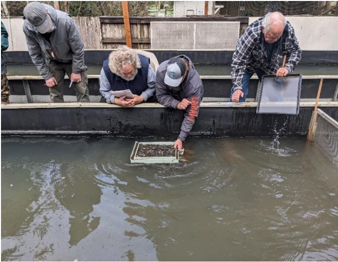
Fish Ponding