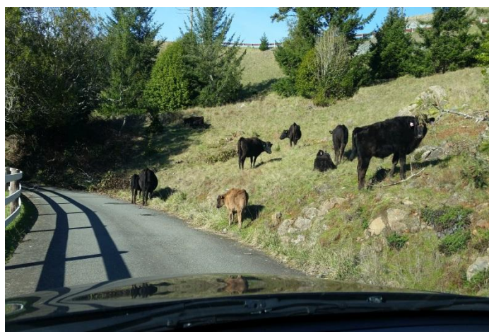
Driving to and from the hatchery. Honking sometimes helps move the cattle aside.