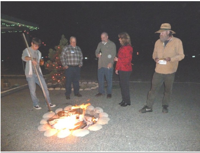
...and the fire keeps us warm. We enjoyed our camaraderie both inside and out.