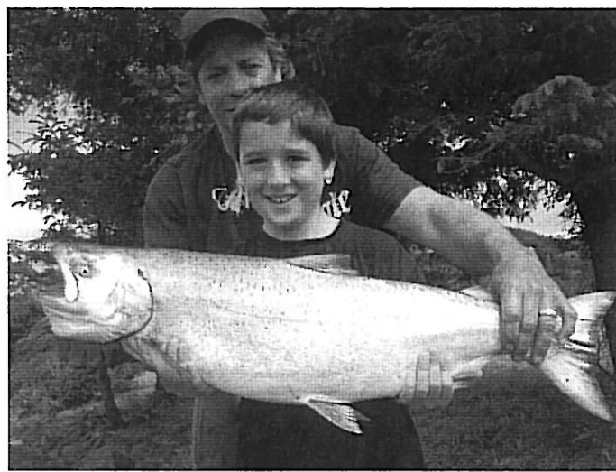
Recent Chinook fishing in Gold Beach