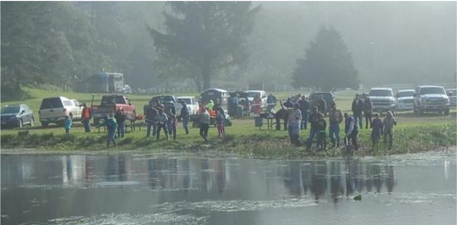
Reel Fishing Day's - Arizona Beach Pond