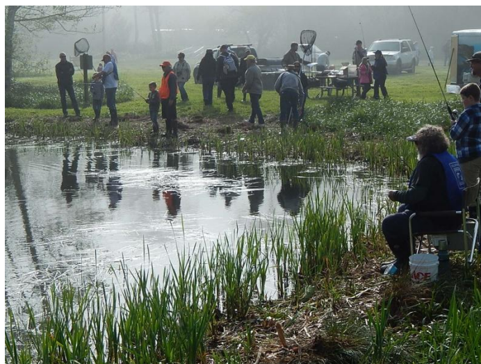
Reel Fishing Day's at Arizona Lake

The third graders showed up the Volunteers were equipped the fish were hungry all had a great time. This was my first time at Reel Fishing Days and my observation of these children having so much fun was impressive. We barely got our hooks in the water one girl began screaming as if she had won the lottery jumping up and down for a 5" to 6" fish. I had the privilege of fishing with four third graders during two days of fishing all returned to school with a bag of fishes to share with their families, and a story to tell about the big one that got away.