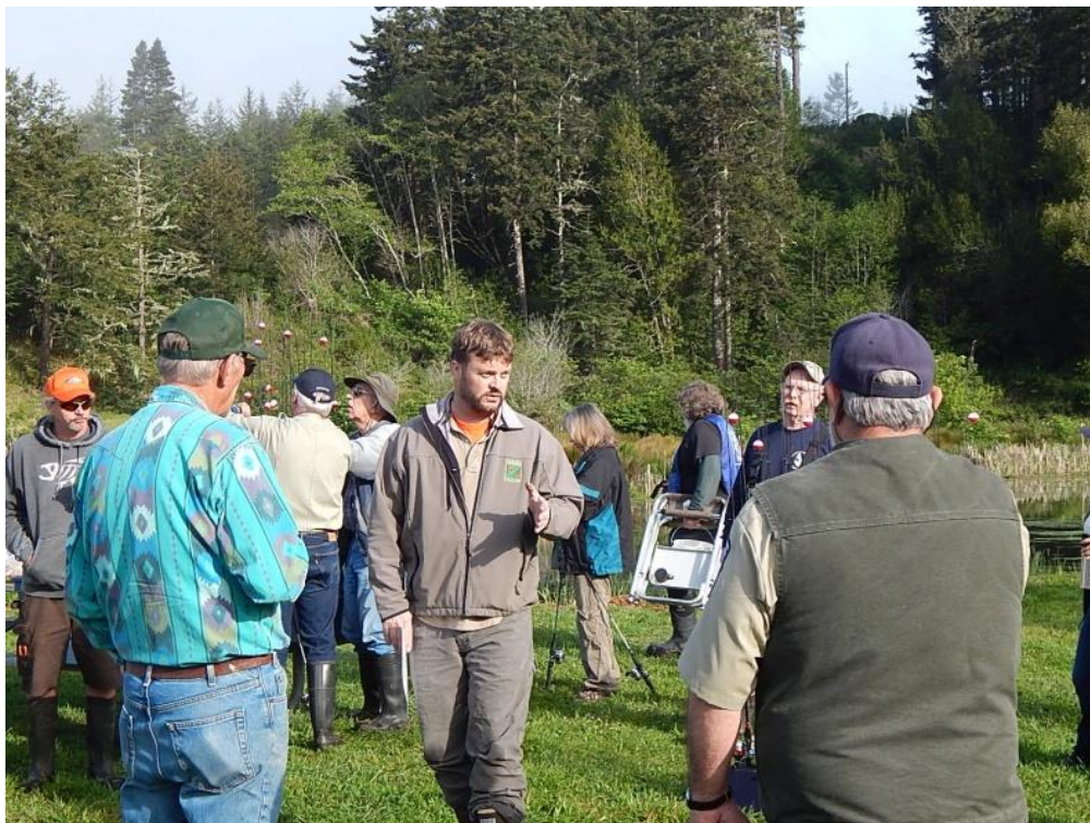
Reel Fishing Day's Instructions