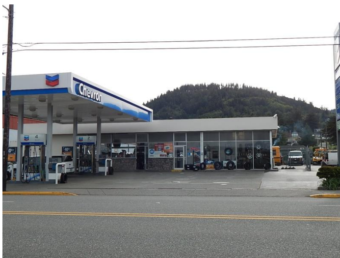
EV'S Chevron