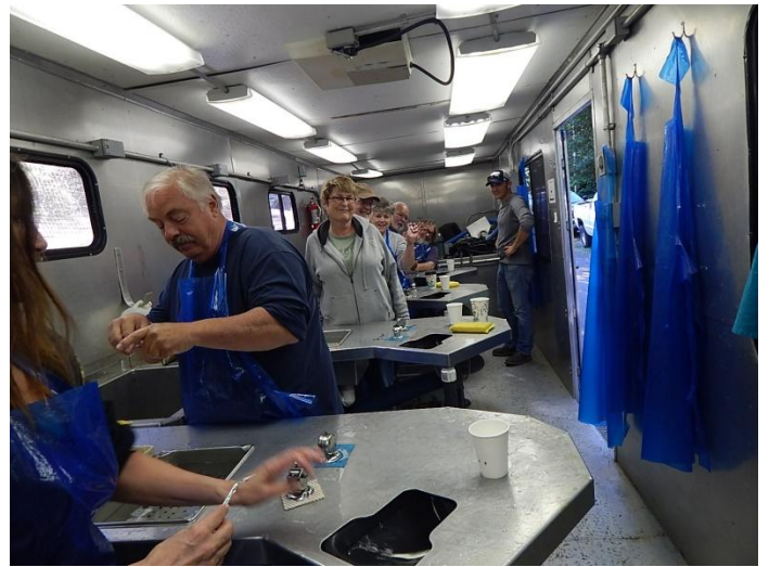
Sunday AM Crew inside the Clipping Trailer

The clippers averaged about 5,000 fish every 2 hours, so we completed all 3 raceways in 3 and half days, Great Job! So, the final count is Raceway #3 has 26,671, Raceway #1 Has 31,359 and Raceway #2 has 15,907 for a total of 73,937. We also have an Albino Chinook in Raceway #1, he /it seems to hang around the top of the raceway and is a bright white, with some black spots. Go visit the hatchery and see if you can spot it!!