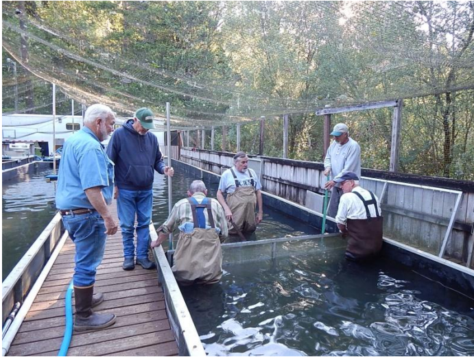
Sunday am crew gathering the fish for clipping

on the Family Fishing Day and did an awesome job; she collected all kinds of prizes & fishing gear and had a raffle for all the kids. Thank you to all the volunteers from CAF, OSCF, ODFW & The Youth Angler Aquatic Instructors who helped BBQ hot dogs, teach kids to fish, sign up kids and just made it a great day!! We didn't have the derby but I still saw quite a few nice Lunkers' caught and a good time had by all!!