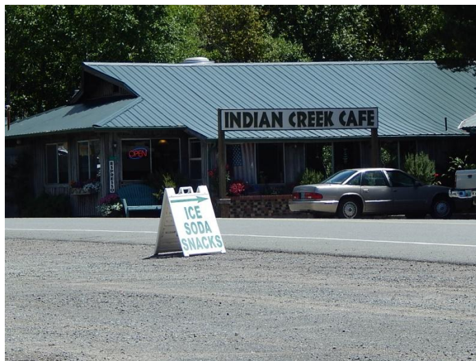
Photo of Indian Creek Café