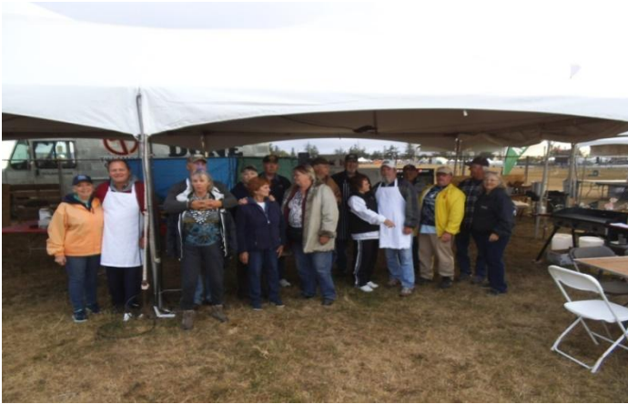
CAF Volunteers at Music Fest