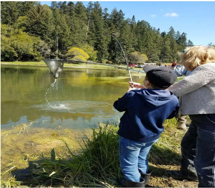
Arizona Pond. A fun day of “catching”