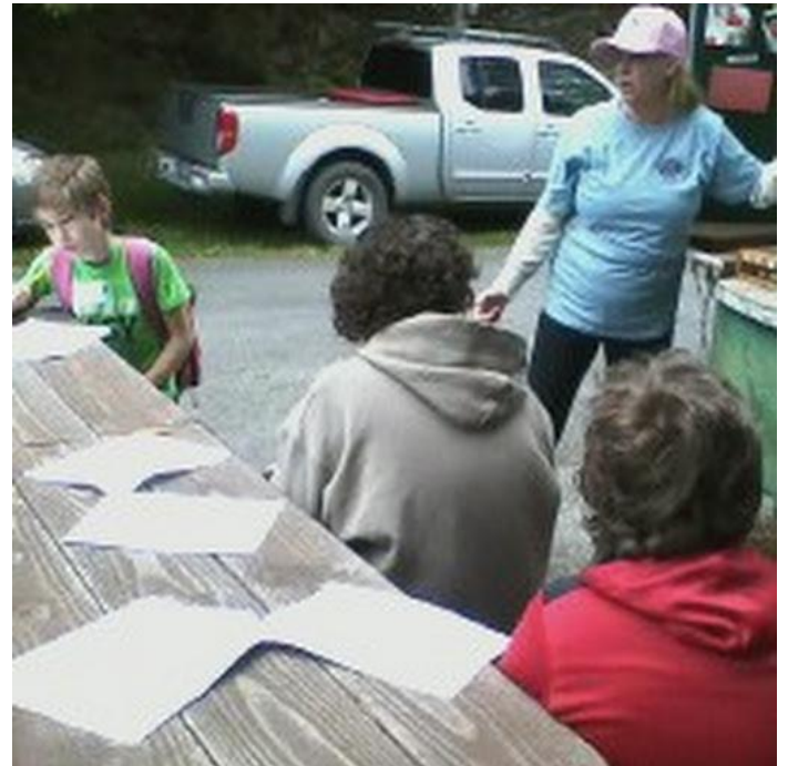
Story Board show at Resource Day