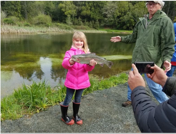
Arizona Pond “catching the last big one”