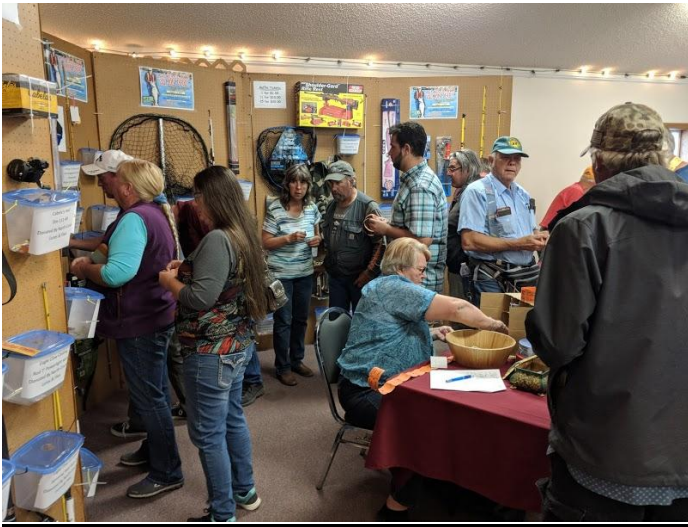
Derby Banquet