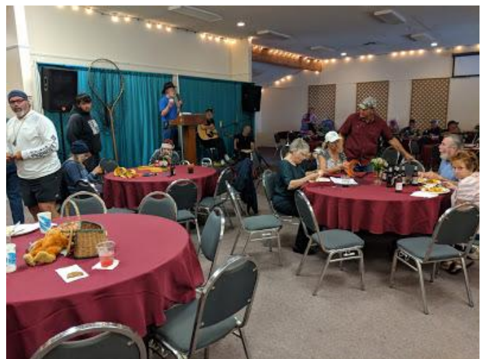
Derby Banquet