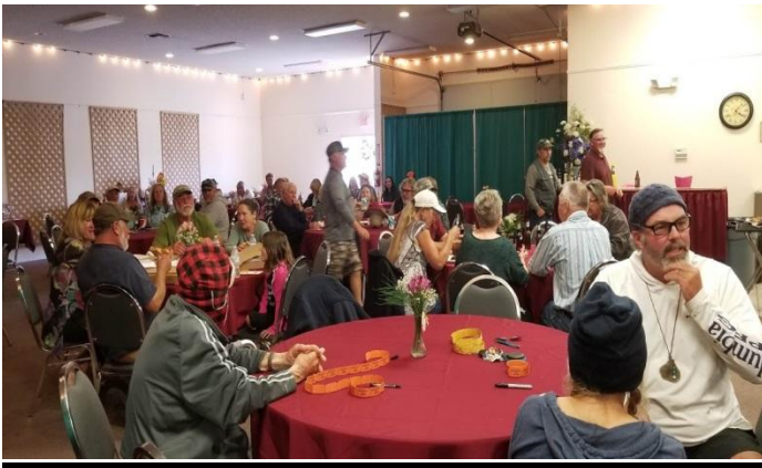
Derby Banquet

"Fishing tournaments seem a little like playing tennis with living balls . . ." Jim Harrison