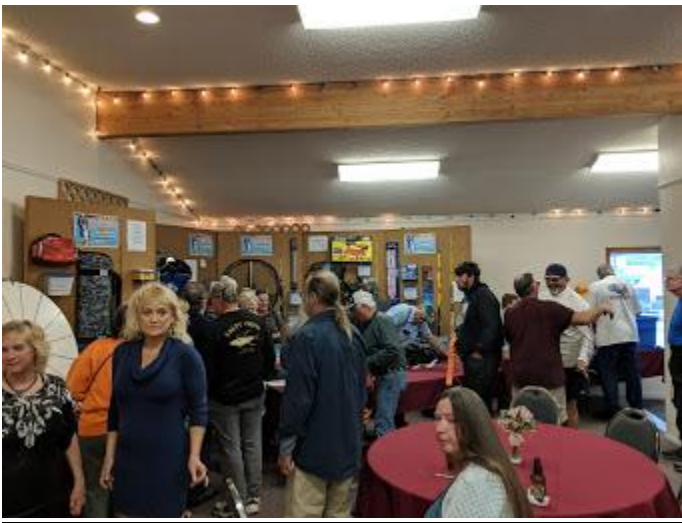
Derby Banquet